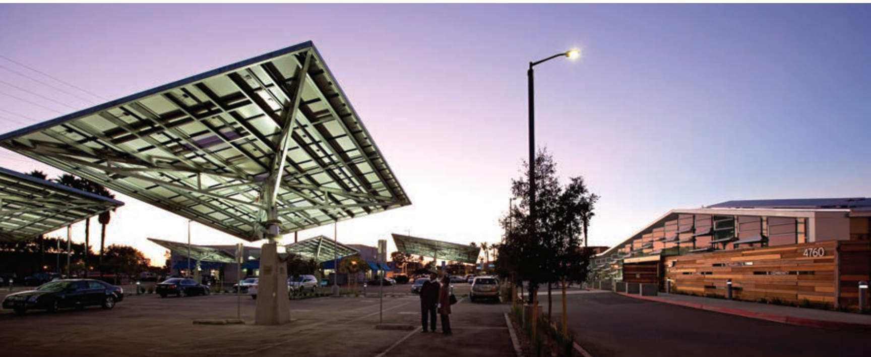
Solar "trees" that move with the sun call it a night at the Energy Innovation Center. Learn more about the center and how you can use it at sdge.com/eic .

Gas service shut-off and restoration appointments should be made by calling 1-800-336-7343 at least two workdays before fumigating your property or installing an earthquake shut-off valve. This can help you avoid making an expensive, dangerous and possibly fatal mistake since working on utility-owned equipment, even inadvertently, can lead to a fire or explosion. Only SDG&E or our certified contractors are authorized to work on our equipment.