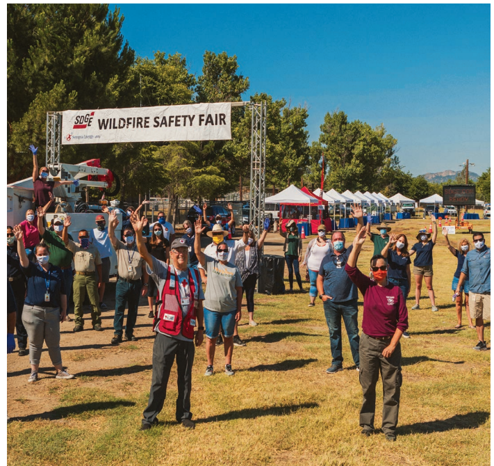
Wildfire safety fairs provide community members an opportunity to interact directly with subject matter experts regarding important safety and operational information.