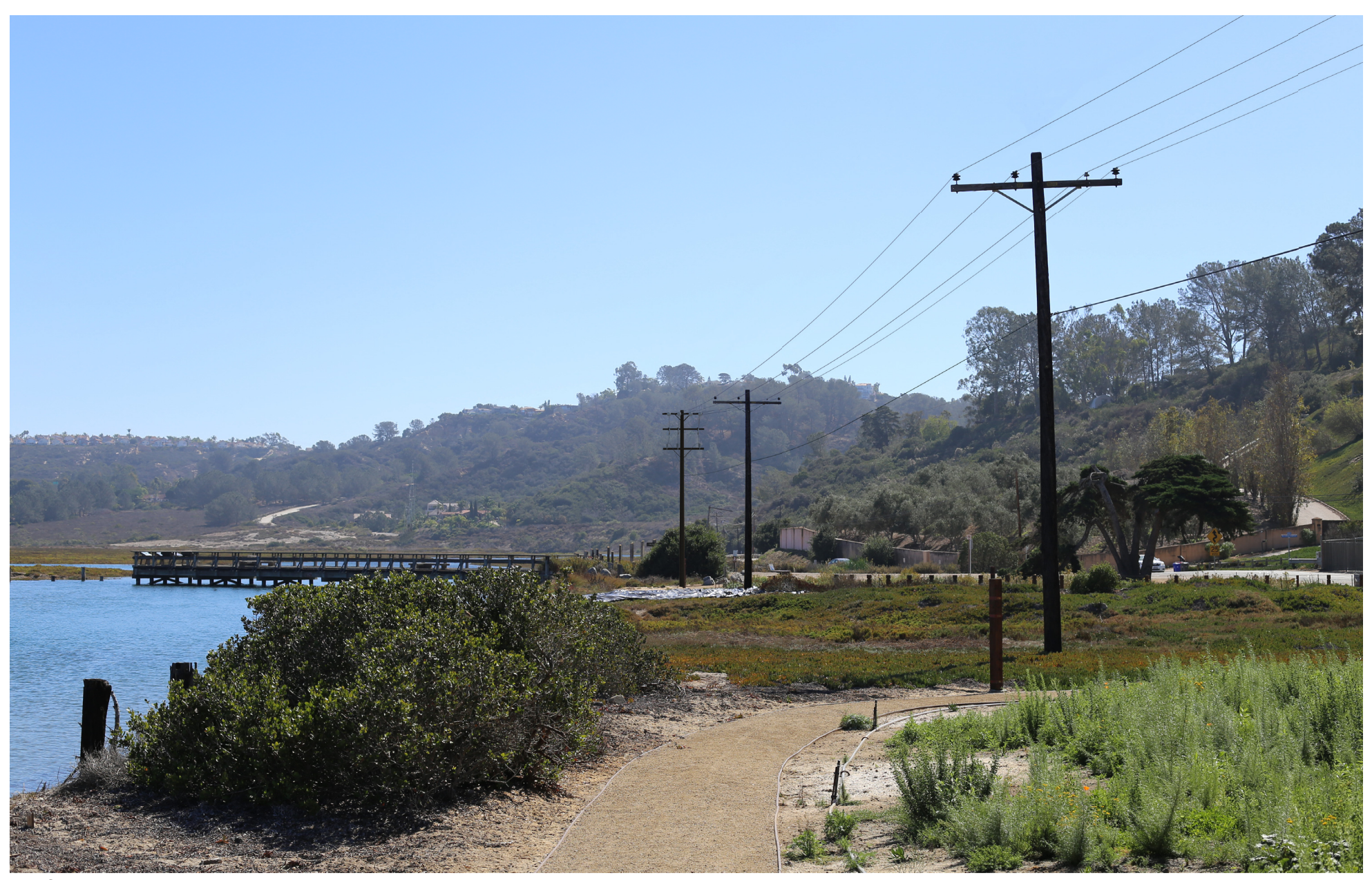
Key Observation Point 3 View of the Proposed Project from San Dieguito River Park looking north See Figure 4.1-1 for viewpoint location