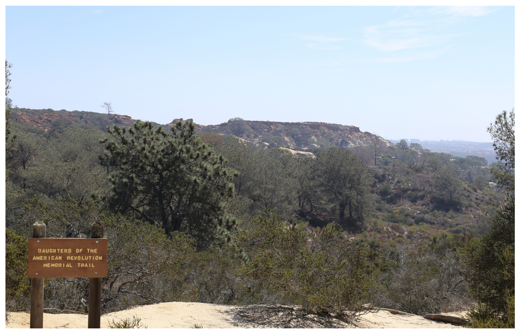
Key Observation Point 6 View of the Proposed Project from Torrey Pines State Natural Reserve looking southeast See Figure 4.1-1 for viewpoint location