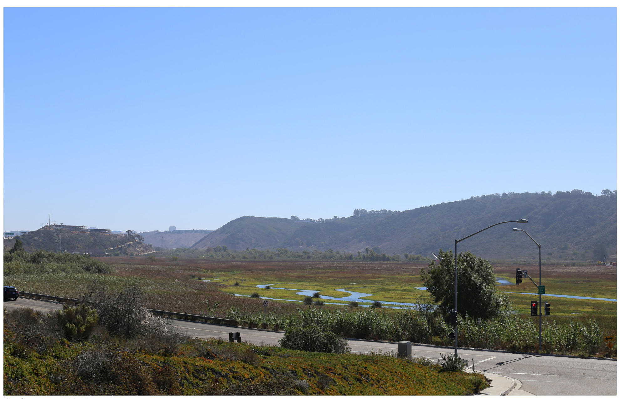
Key Observation Point 8 View of the Proposed Project from Portofino Road looking south See Figure 4.1-1 for viewpoint location