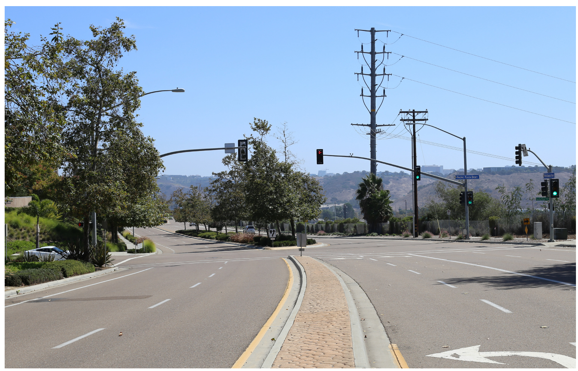
Key Observation Point 11 Existing View from Via Sorrento Parkway looking southeast See Figure 4.1-1 for viewpoint location