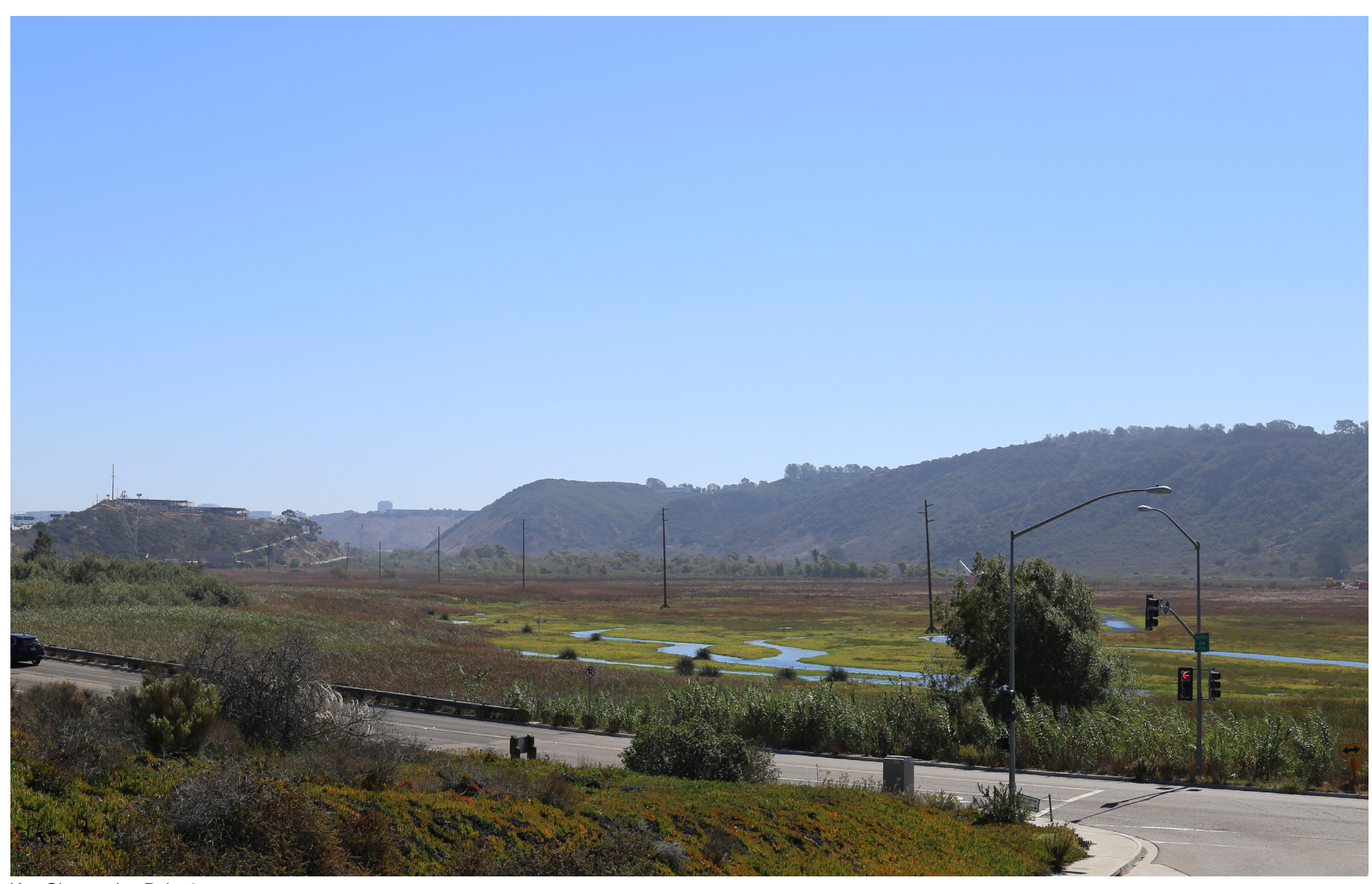
Key Observation Point 8 Existing View from Portofino Road looking south See Figure 4.1-1 for viewpoint location