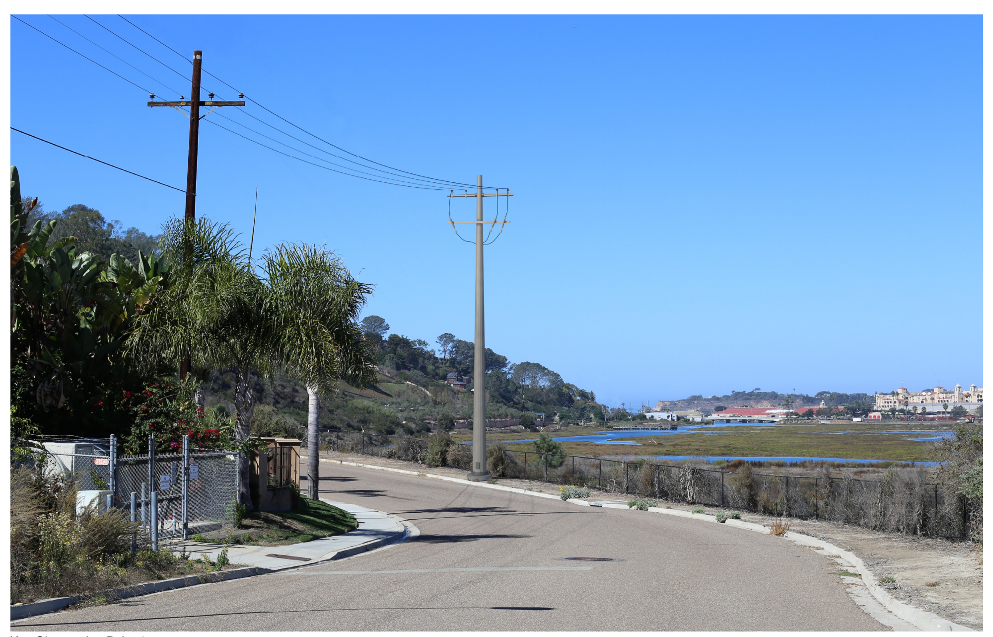
Key Observation Point 4 View of the Proposed Project from Racetrack View Drive looking northwest See Figure 4.1-1 for viewpoint location