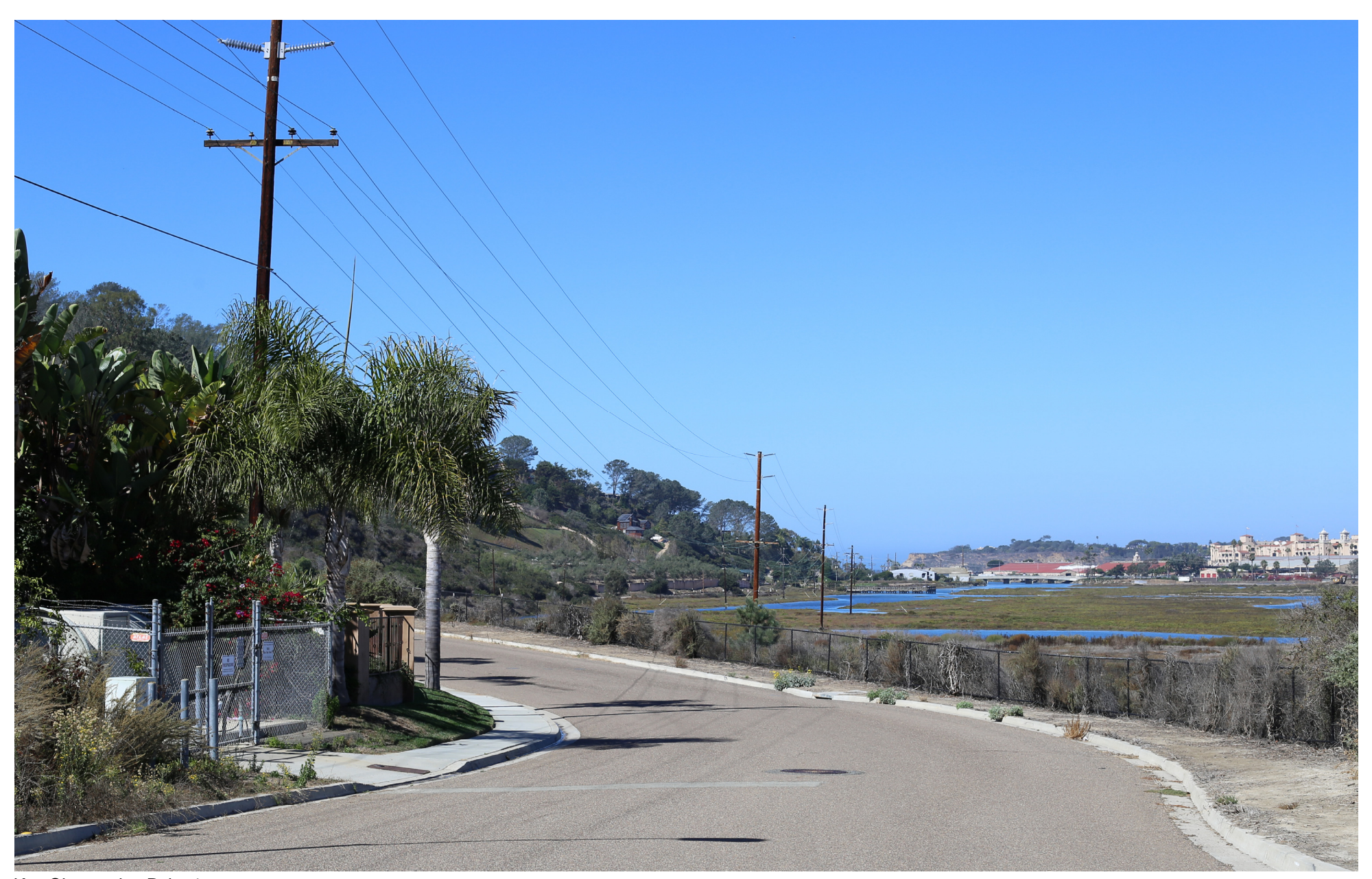
Key Observation Point 4 Existing View of the Proposed Project from Racetrack View Drive looking northwest See Figure 4.1-1 for viewpoint location