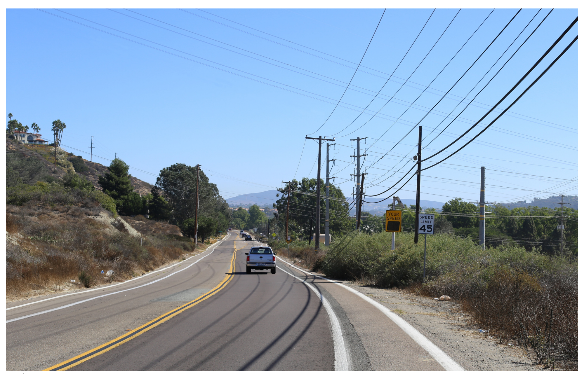
Key Observation Point 1 View of the Proposed Project from Via De La Valle looking east See Figure 4.1-1 for viewpoint location