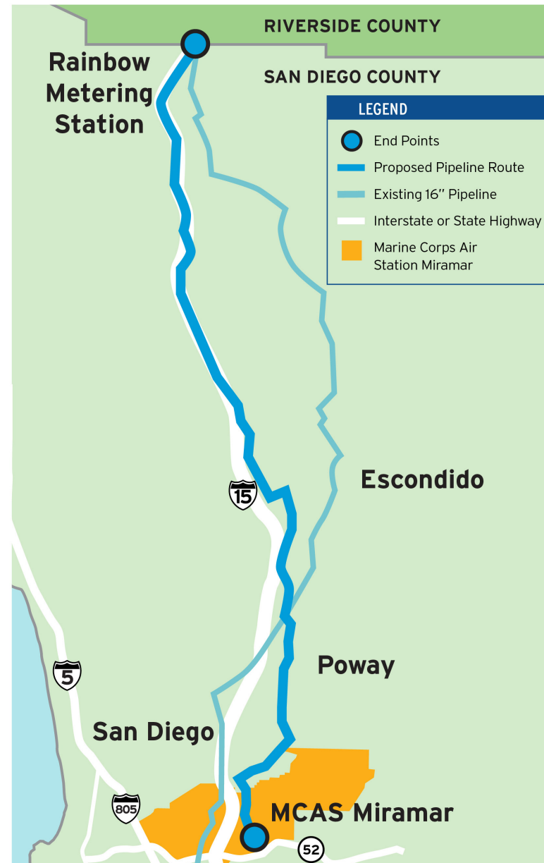
This map of the proposed project route is for illustration purposes only. For detailed route maps, visit sdge.com/pipeline-project .

In 2016, PricewaterhouseCoopers conducted an independent analysis of the relative costs and benefits of these alternatives in more detail and concluded that the Pipeline Safety & Reliability Project is the most cost-effective, prudent alternative.