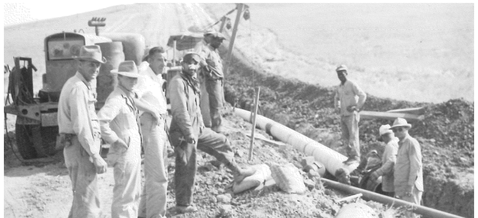
SDG&E crews working to install the Line 1600 pipeline in 1949.

SDG&E's highest priority is the safety of our customers, employees and the communities where we deliver energy. That's why maintaining and replacing aging infrastructure is a core part of our business. One of SDG&E's key safety initiatives is the Pipeline Safety Enhancement Plan (PSEP), a proactive, system-wide plan for enhancing the safety of our aging natural gas infrastructure. Our proposal to replace Line 1600 - a 1940s-vintage natural gas transmission line - with a new, modern pipeline is one of many PSEP projects underway here in San Diego.