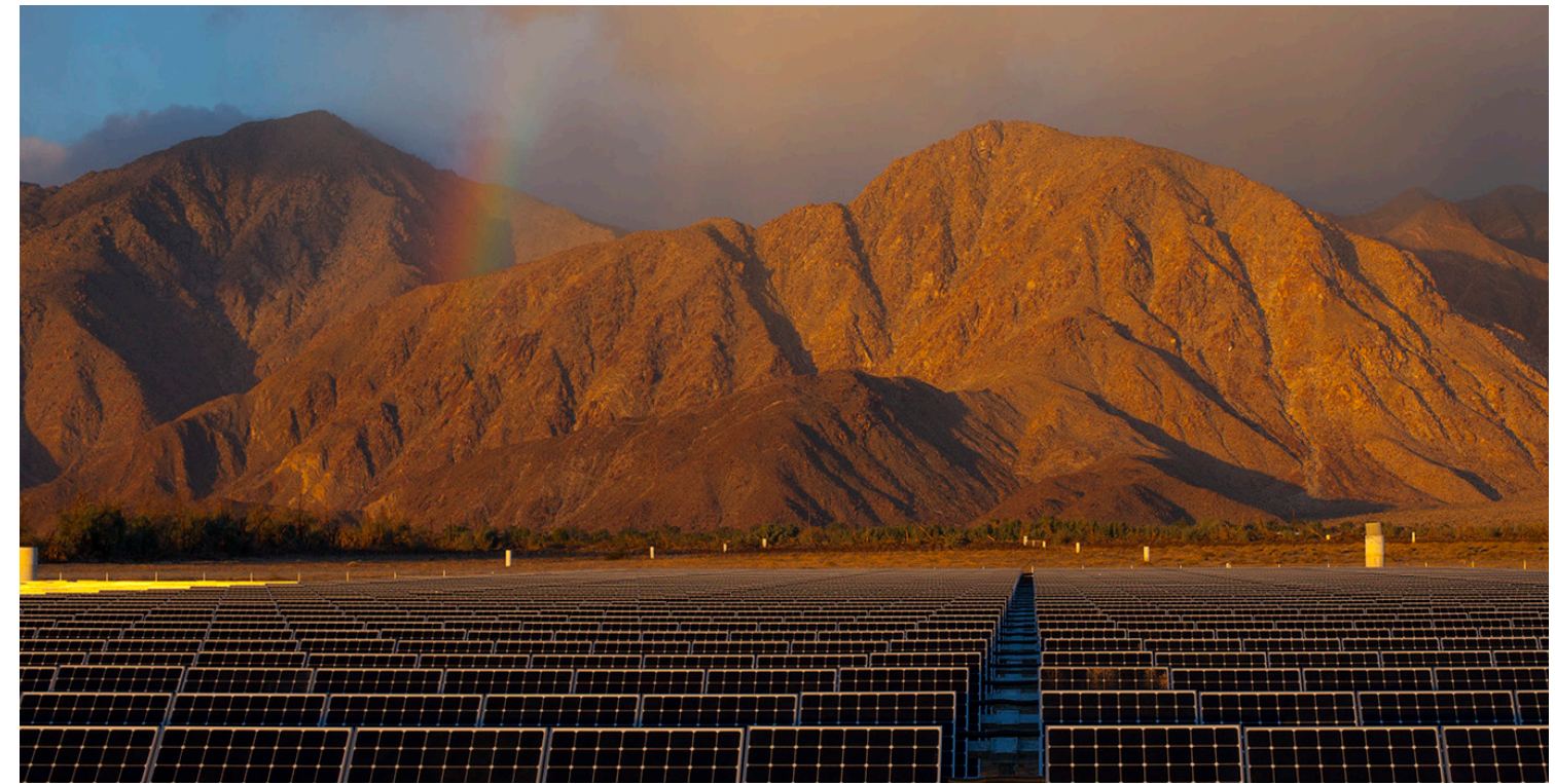
The 26 MW NRG Borrego Solar Facility in Borrego Springs delivers clean solar power to SDG&E customers in San Diego.