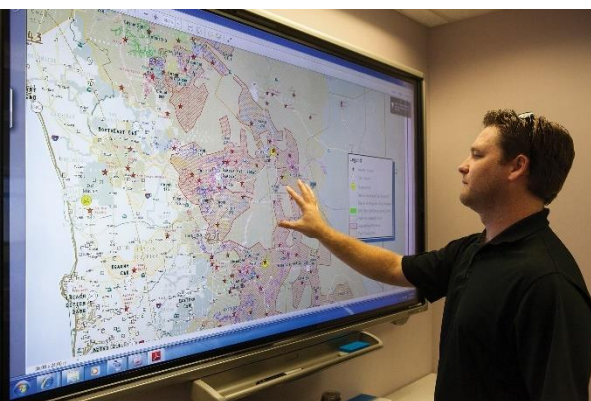
What is the Operations and Support Assessment?

The Operations and Support Assessment is an assessment that assesses attributes that are important for success in Operations and Support roles at San Diego Gas & Electric. This assessment is not timed, but is expected to take approximately an hour to complete. Please keep in mind that this assessment is meant to measure underlying knowledge, skills, abilities, and other characteristics that are critical to success in these roles. As such, the content within the assessment may not be identical to the situations, equipment, and tools that you will encounter in the role.