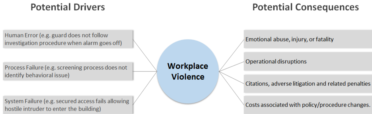
Figure 1: Risk Bow Tie