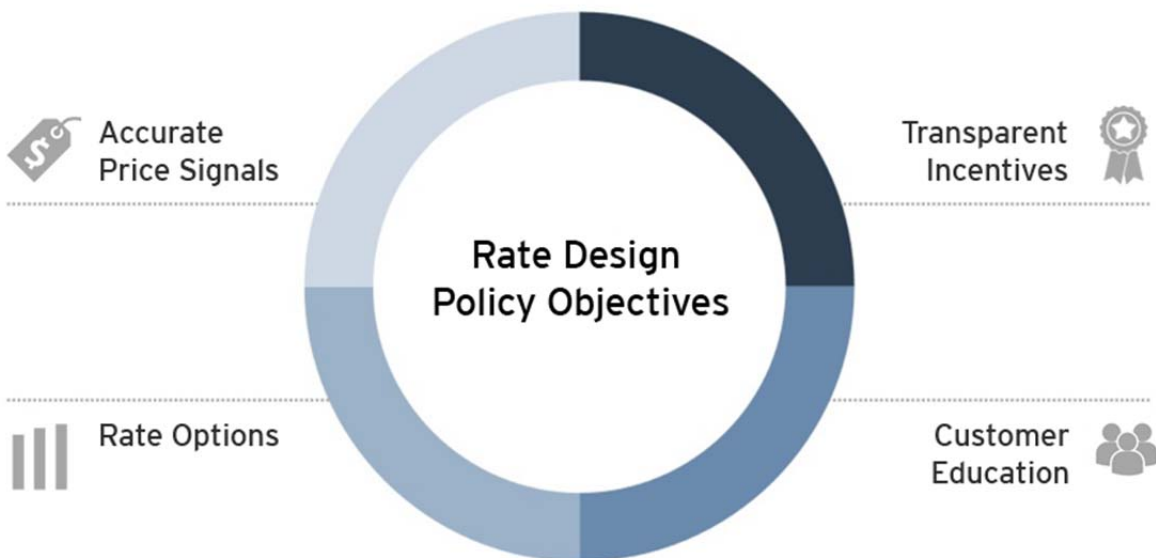
4 5 Diagram 1: SDG&E Rate Design Policy Objectives

3 SDG&E’s four policy objectives are summarized in the diagram below.